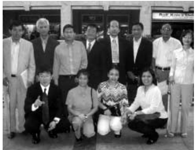
TQM Experts' Meeting in Singapore

All the interested parties left the two-day TQM Experts' Meeting with a sense that the meeting's objectives had been attained.