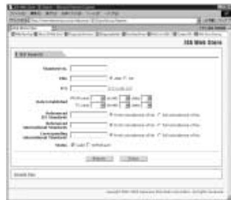
JIS Standard Searching Page